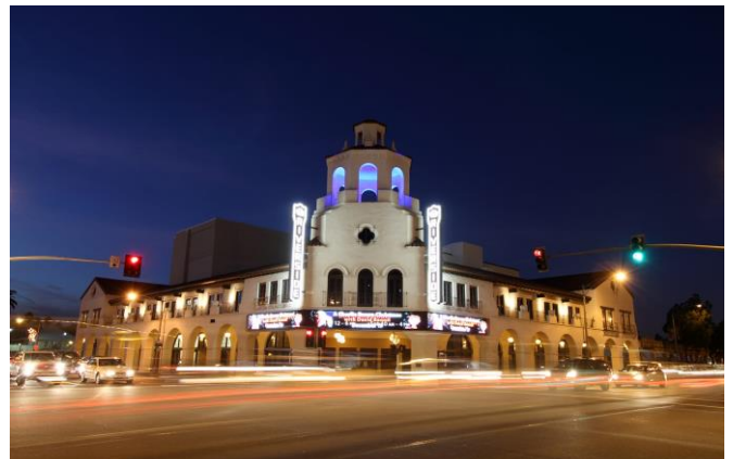
The Fox Performing Arts Theater at night.

To all the performers tonight and to those educators who bring out the best in each and everyone of them. Job well done!